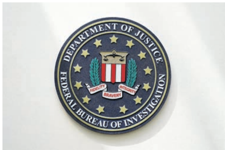
An FBI seal is seen on a wall on Aug. 10, 2022, in Omaha, Neb.